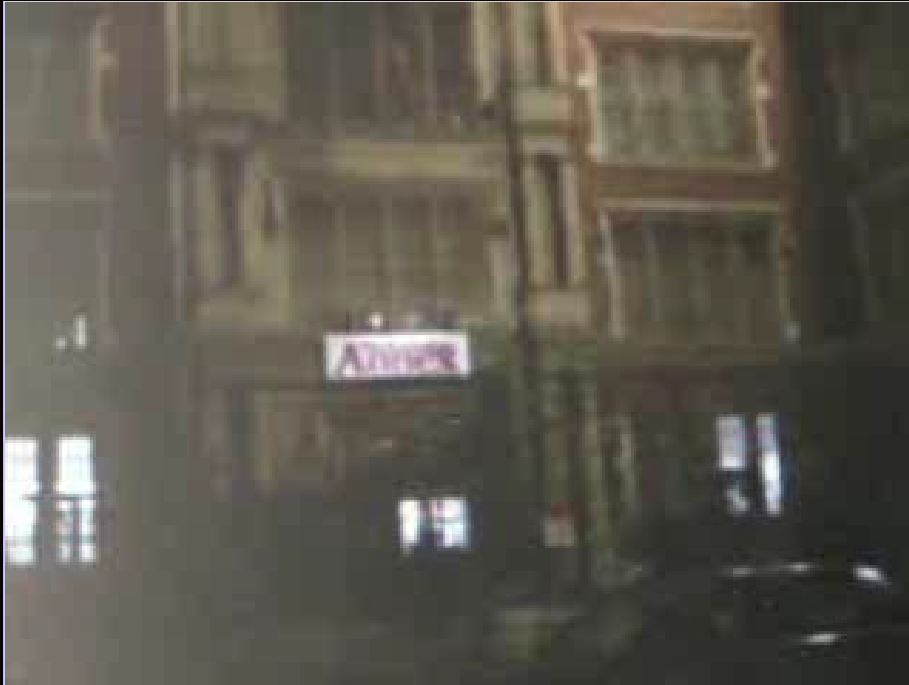
Video: SNL Clip