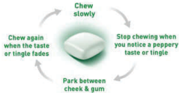
Figure 1. How to use Nicorette gum.

While it is clear that companies, such as the producers of Nicorette, advertise and promote the use of NRT products as a successful smoking cessation strategy, it is telling that the Ontario government and organizations such as the Centre for Addiction and Mental Health (CAMH) also promote their use. This is evidenced by the Ontario government removing PST from all NRT products (CAMH, 2007a, para. 1) and by its partnering with the Centre for Addiction and Mental Health in the Smoking Treatment for Ontario Patients (STOP) program to give NRT to 13,000 smokers at no cost (CAMH, 2007b, paras. 1-2). As a result, 1,600 of these participants quit smoking, which pleased the Clinical Director of Addiction Programs, Dr. Peter Selby, who stated, “It’s clear there’s both a demand and a need for nicotine replacement therapy. With the Ontario government’s help, we’re committed to find the most effective ways to help smokers quit” (CAMH, 2007b, paras. 4-5). Corporations, organizations, and the provincial government agree that NRT products are useful in helping Ontarians successfully kick the habit.